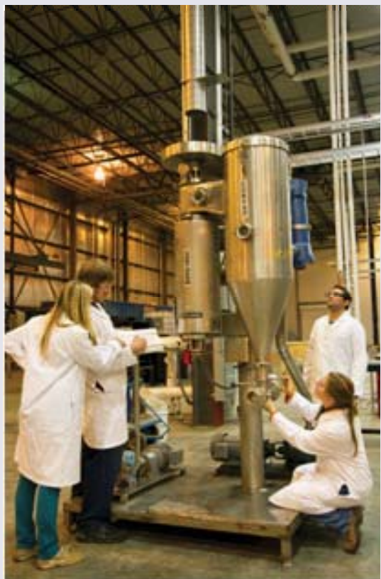
Equipment set-up at UMaine's FBRI Technology Research Center in Old Town, ME.

Companies on the verge of sending cutting-edge, forest bioproducts-based technologies into the marketplace will have new commercialization testing and demonstration capabilities when the University of Maine's Technology Research Center (TRC) opens this summer at 880 Main St., in Old Town, Maine. A grand opening will be held on June 18. TRC, a component of the University of Maine's Forest Bioproducts Research Institute (FBRI), is located on the grounds of Old Town Fuel & Fiber, a pulp mill purchased in 2008 by private equity firm Patriarch Partners.