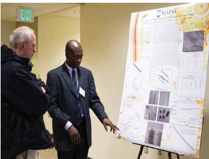
Chemical Engineering graduate students held a poster display showcasing their current research projects at Paper Days.

Speaker presentations and additional pictures are featured on the Foundation's website at: