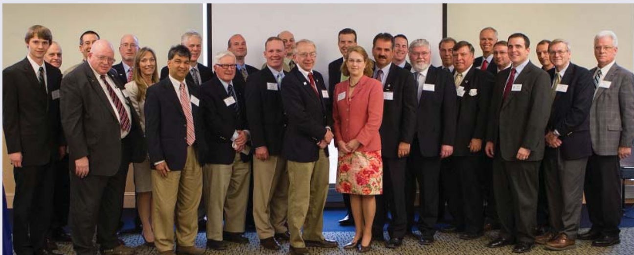
University of Maine Pulp & Paper Foundation Executive Committee and Board of Directors pose for a picture at Paper Days 2012.

Copies of the Foundation's 2012 Annual Report are available from the Foundation office on request.